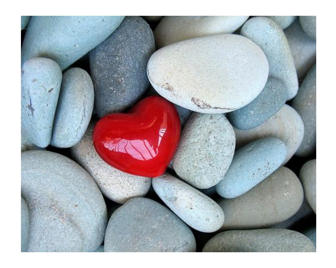
CARE FOR THE CAREGIVER - YOU

Working hand in hand with the community to serve IHSS Consumers so they may remain safe and independent in their own home.